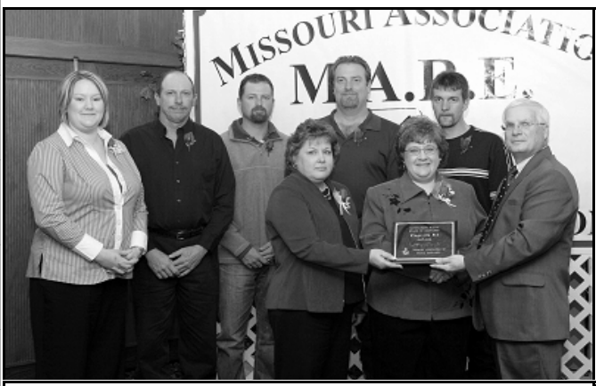
Kingsville G - G & chool B oard 2008 Outstanding R wrat & chool B oard of Education