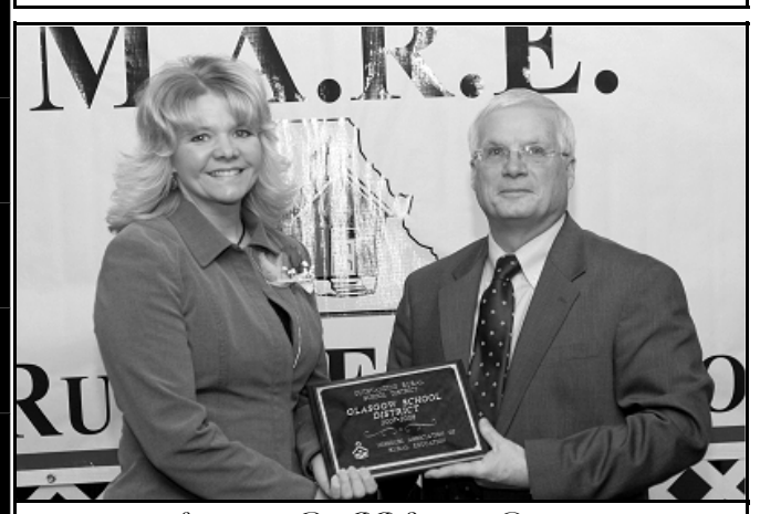
A lasgow R-II School D istrict R epresentative A ccepts 2008 Outstanding R urat School D istrict Award